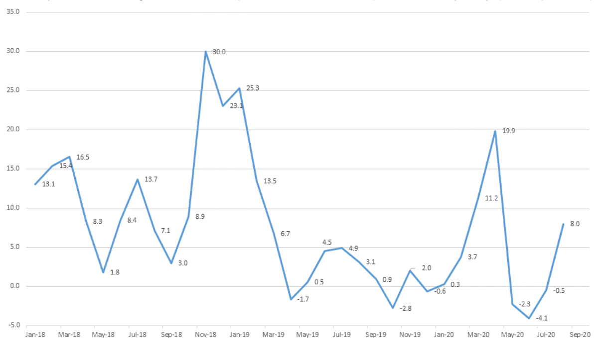
Monthly Canberra regular unleaded price differential compared with Sydney (cents per litre)

Consistent with Recommendation 3 of the Select Committee's Report on ACT Fuel Pricing, the NRMA supports FuelCheck or an alternative real-time fuel pricing scheme being implemented in the ACT to improve transparency and put downward pressure on fuel prices.