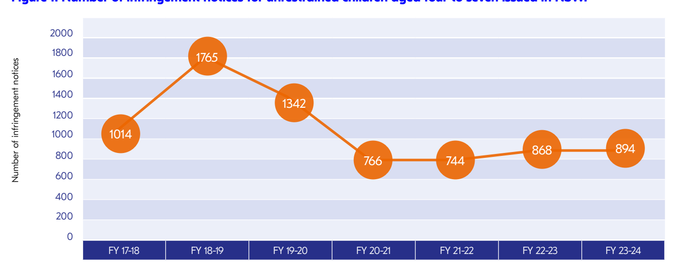
Figure 1. Number of infringement notices for unrestrained children aged four to seven issued in NSW.

Car seat diversion programs must also have long term sustainable funding with additional support programs for people with financial hardship to access a free and compliant child car seat.